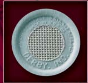
Patented Secure Care Flow Vent Helps Keep Contaminants from Mattress Interior