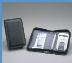
Emergency Medical and Diagnostic