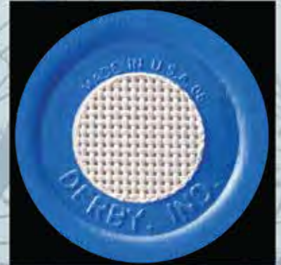
Secure Care Flow Vent Helps Keep Contaminants from Mattress Interior