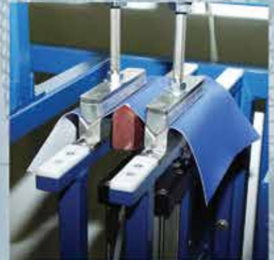
100% Sealed Seams Reduce Health Risks and Provide Incredible Seam Strength